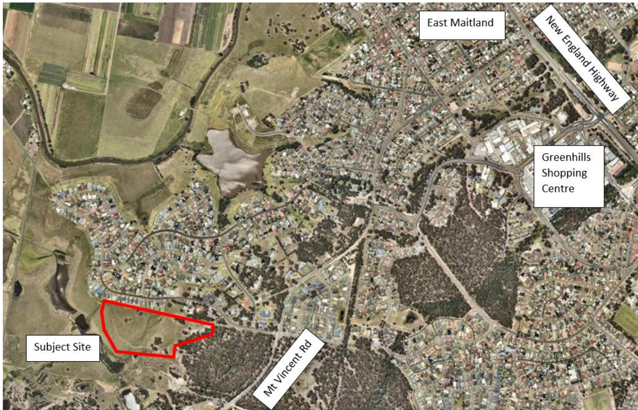
Figure 2: Locality (aerial). Site outlined blue.